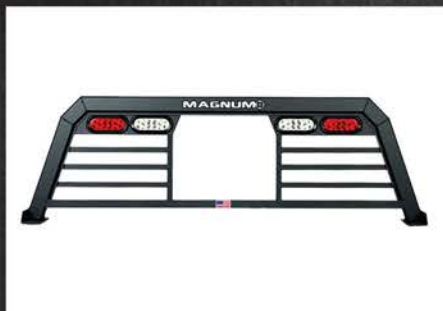
Low Pro Window Cut Out

For more information, visit MagnumTruckRacks.com