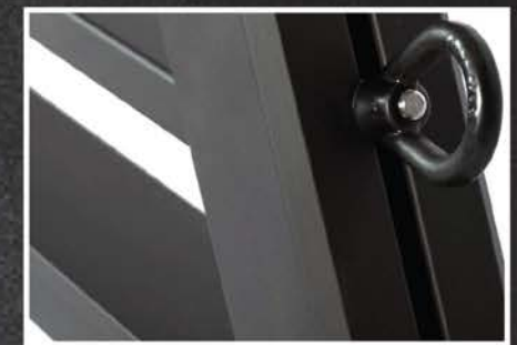
Sliding D-Ring in Accessory Glide Track