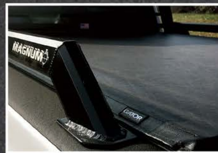
Magnum Racks & Rails Fit With Most Tonneau Covers