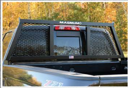
EC Rack Series - Rugged and Functional Shown with optional mesh sides