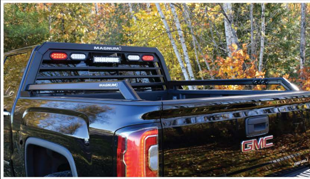
Photo shown with optional bed rail kit and 13" LED utility flood light.