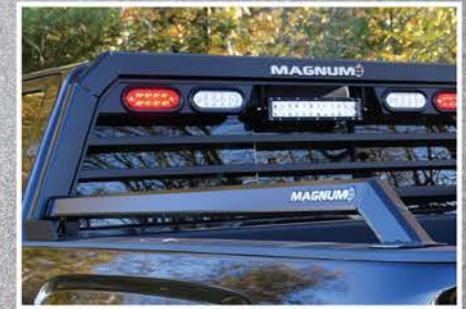
Optional Magnum Bed Rails with Glide Track System