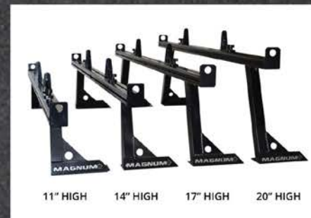
Rear Racks in Various Heights