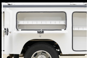
Center Compartment with Dropdown Door (showing Double Walled Doors)