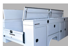
Flip Top Compartments