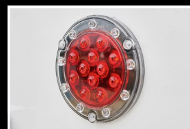
LED Ultra-thin 6" Round Stop/Tail/Turn/Backbody Lights