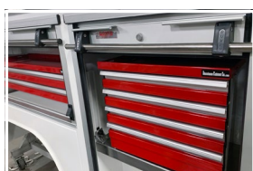
Slide-out Tool Boxes