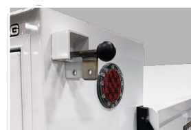
Traditional Rod Lock System