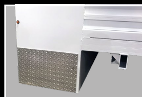
Tread Plate Splash Guards on Front Wall