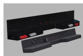
Bumpers - Lighted & Non-lighted