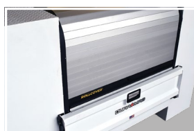
Roll-up Tonneau Covers