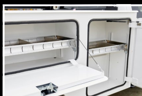
Pass Thru Compartment Shown Between Front and Middle Boxes