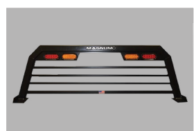
Magnum Rack with Optional Lights